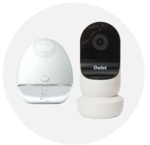
Baby & Mom