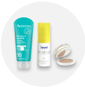
Acne & Skincare